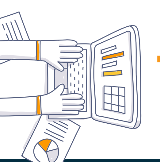
TABLE OF CONJENIS: